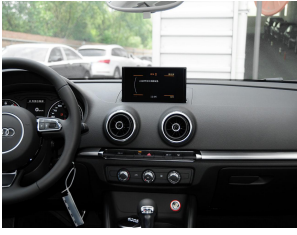
1. The original car control (Power off before installation)