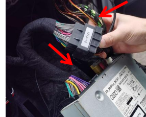
11. Connect power cable