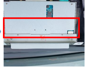
12. Install the hardware bracket and base of the machine