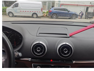
2. Pry open the original screen casing frame