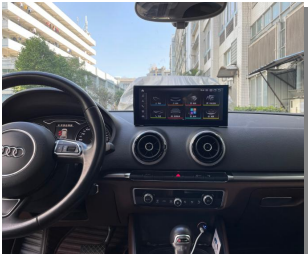
14. Installation completed effect drawing