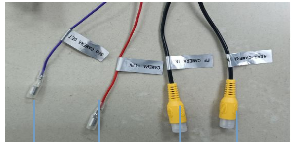
360 Camera power supply Front camera Rear camera