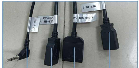
AUX USB1 SIM card USB2