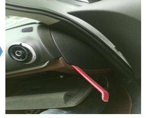
8. Pry open the baffle plates on the left and right sides of the glove box