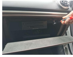
7. Remove the fixing screws from the glove box