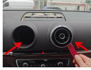
3. Pry out two air conditioning vents