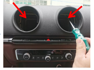
4. Unscrew the retaining screw