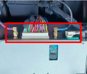
13. Connect the wire connection of the machine