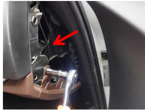
9. Unscrew the retaining screws and remove the glove box