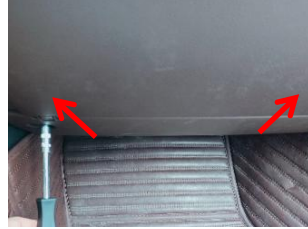
10. Unscrew the bottom of the glove box and remove the glove box