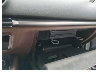
6. Remove the original engine