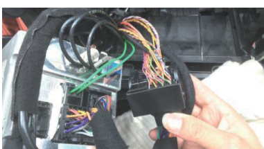
13. Remove the original power harness and optical fiber, then plug it with Android power harness.