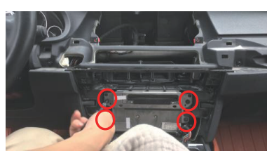
11. Remove the fixed screws from the Host.