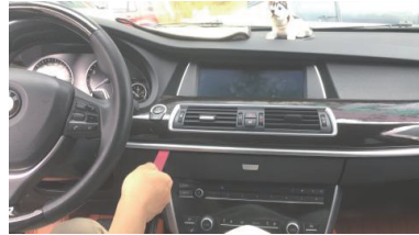
2. Pry loose and take out the decoration strip.