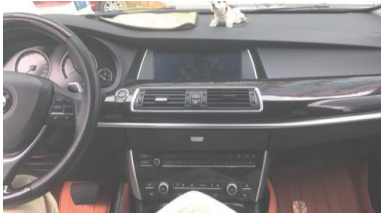
1. Original Monitor (Power off before installing).