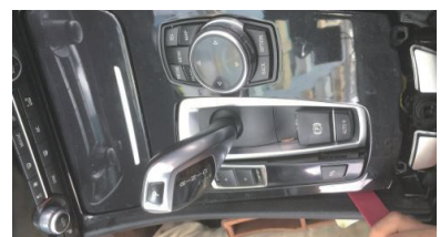
9. Pry loose the decorative cover of the Gear and take it out.