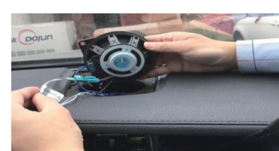
12. Connect well the center speaker cable with android cable.