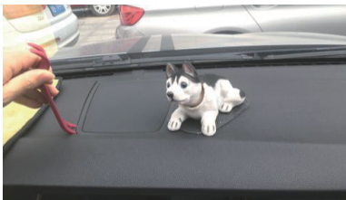
4. Pry loose the net and take out the center speaker.