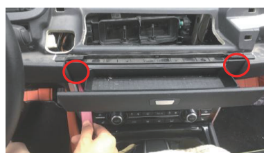
5. Pry and remove the cover of the screw hole.