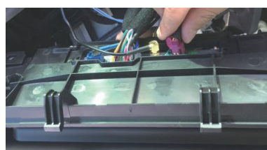
14. Plug well all the cables.