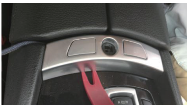
7. Pry the decorative cover and remove the screws.