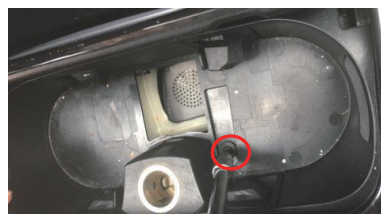
8. Remove the screws in the bottom of the cup holder.