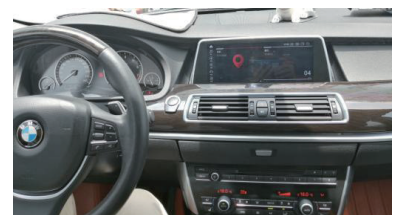
15. Effect photo after installation well.