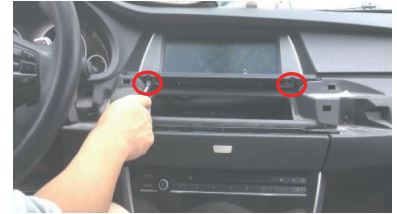
3. Remove the fixed screws from original monitor.