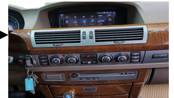
24. Full Test.