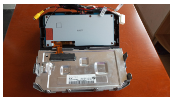
17. Connect the socket from Android device with aluminum back cover