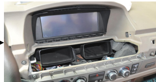
6. Take out the air outlet