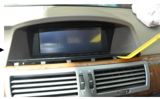
2. Pry loose air Outlet from screen and take it out