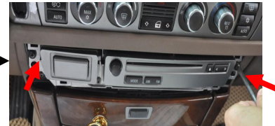
8. Remove the screws.