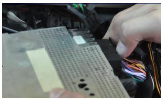
9. Pull out the original power harness.