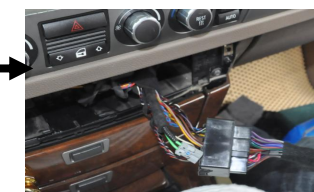
23. Connect the original power harness with Android Power harness.