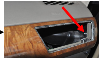
4. Remove the screws