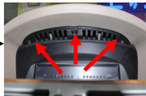
10. Remove the screws of the original monitor.