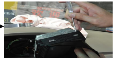
12. Pried loose the Plastic cover with a flat screwdriver