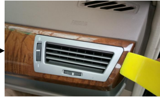
3. Pry loose air Outlet and take it out