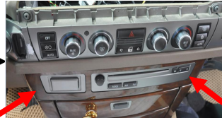
7. Pry loose and take out the decoration strip.