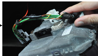
11. Remove the original screen socket.