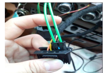
20. Connect the Optic Fiber cable into our adapter.