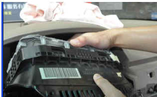
13. Take out the aluminum back cover from original screen carefully.