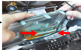
14. Take out the socket from the screen