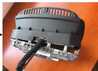
18. Assemble well Android screen and back cover