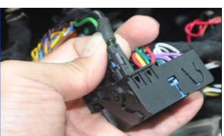
21. Take out the Optic fiber cable and plug it into the factory harness.