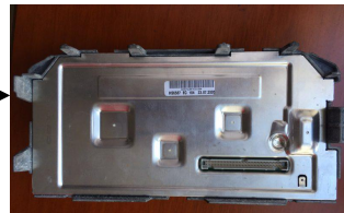
15. Attached is original PC Board and Back