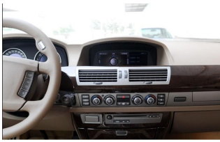
1. Original Monitor