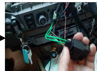
19. Remove the Optic fiber cable from screen socket and Connect the socket with our adapter