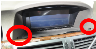
5. Remove two screws and take out the decoration strip