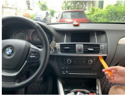
2. Pry and remove the trim panel of the air-conditioning.