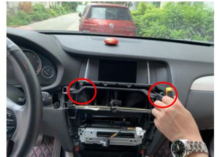
6. Remove three fixed screws of the original monitor.