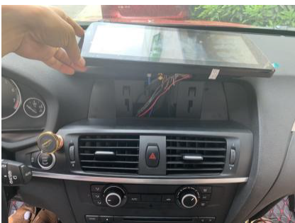
10. Restore all of them well. And the last step is that Assemble Android screen well to the frame and buckle up from top to bottom.