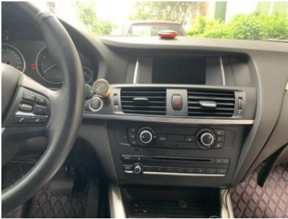
1. Original Monitor (Power off before installation).