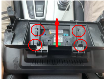
8. Pull up the frame, the buckle will come loose and push down it. Then The frame will be dismantled.