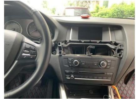
3. Pry loose and take out the trim panel of CD player