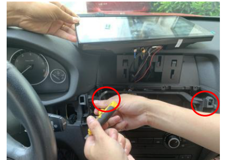
9. Put the cables all through the frame, and Fix well the frame on the original car.