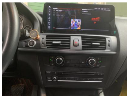
11. Effect picture after installation.