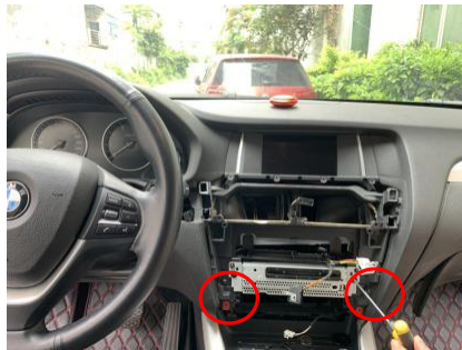
5. Remove fixed screws of the original HOST