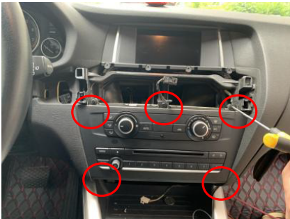
4. Remove fixed screws of the panel.